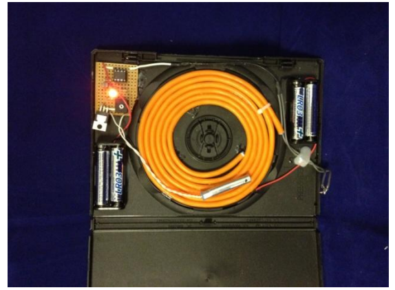
Light Sensitive Postal Device