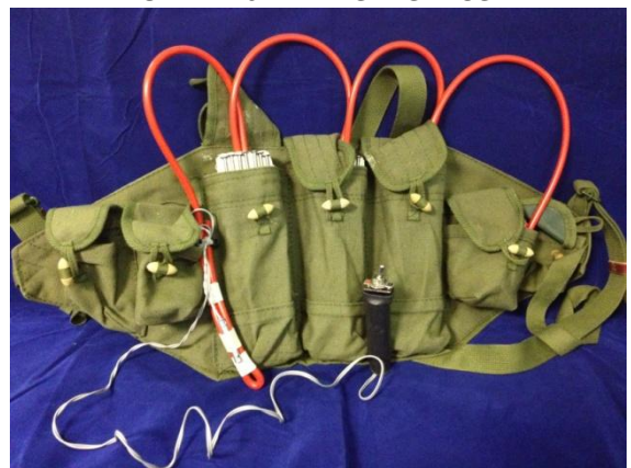
Chicom Webbing Suicide Vest