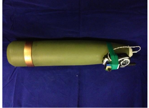
105mm Atrillery Shell with PMR and Add-On Circuit