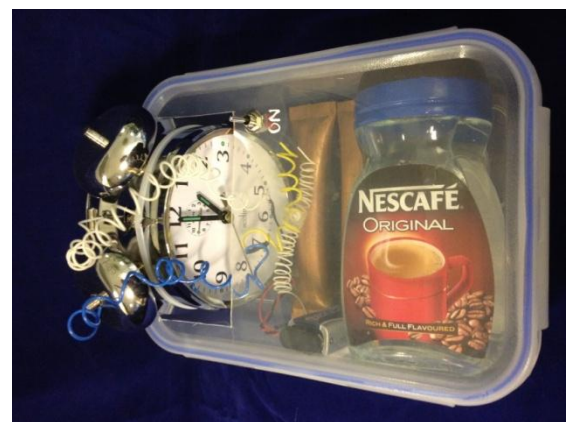
Criminal Time Device