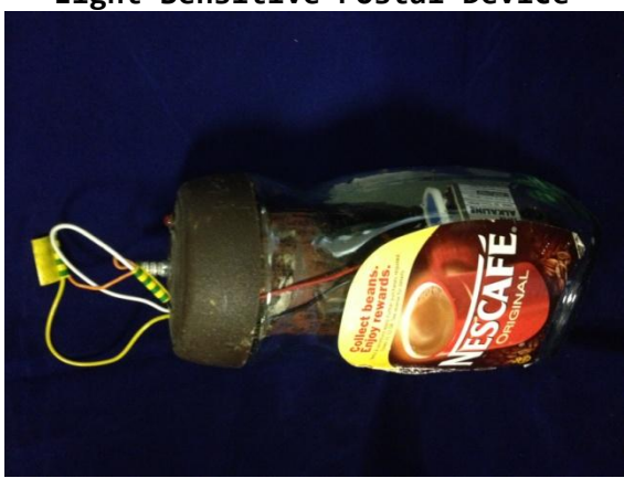
Coffee Jar Grenade